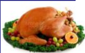
“Now doesn’t that turkey look simply delicious?”

are not members of CCF. Many students generally attend this function, so you might even make a few new friends! Everyone could use a few more Smores, right?