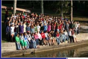
All the students that attended the retreat, standing by the lake.

Every year a group of CCF students attend the Catholic Student Union Retreat that is hosted by Florida State University. Students gather at Camp Cherry Lake, a peaceful site that hosts a beautiful lake and is the perfect place to get away from the world and get