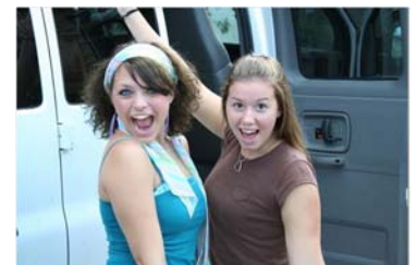
Helping those in need brings joy to everyone!

house and cook a meal for the homeless. Both are truly fulfilling experiences, and many students enjoy helping others.