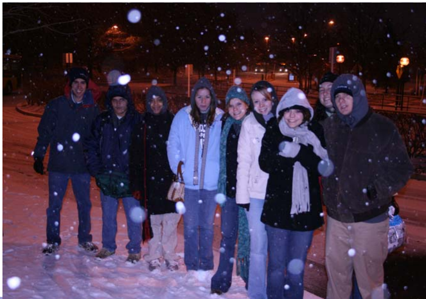
A group of CCF students standing out in the snow in Washington, D.C. We even enjoyed a fun snowball fight!!!